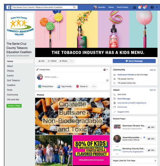
The Santa Cruz County Tobacco Education Coalition Facebook page.

Important decision makers, including many local elected officials and policy makers, use Facebook, Twitter, Tumblr, YouTube and Instagram to connect with their constituents.