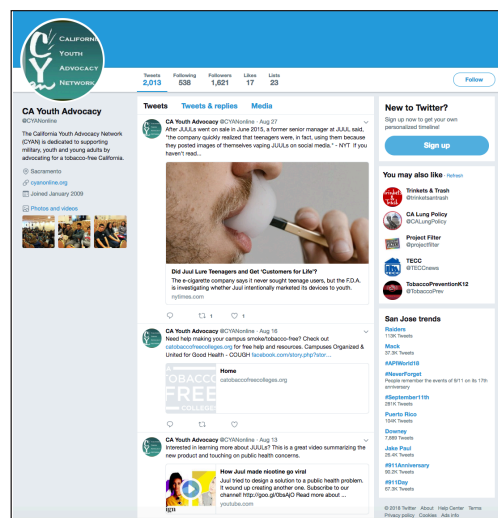
The California Youth Advocacy Network Twitter page.